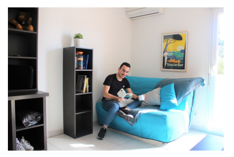
582 impasse Eugène Augias 83130 La Garde