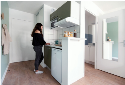
5 place Charles de Gaulle 34170 Castelnau-le-Lez